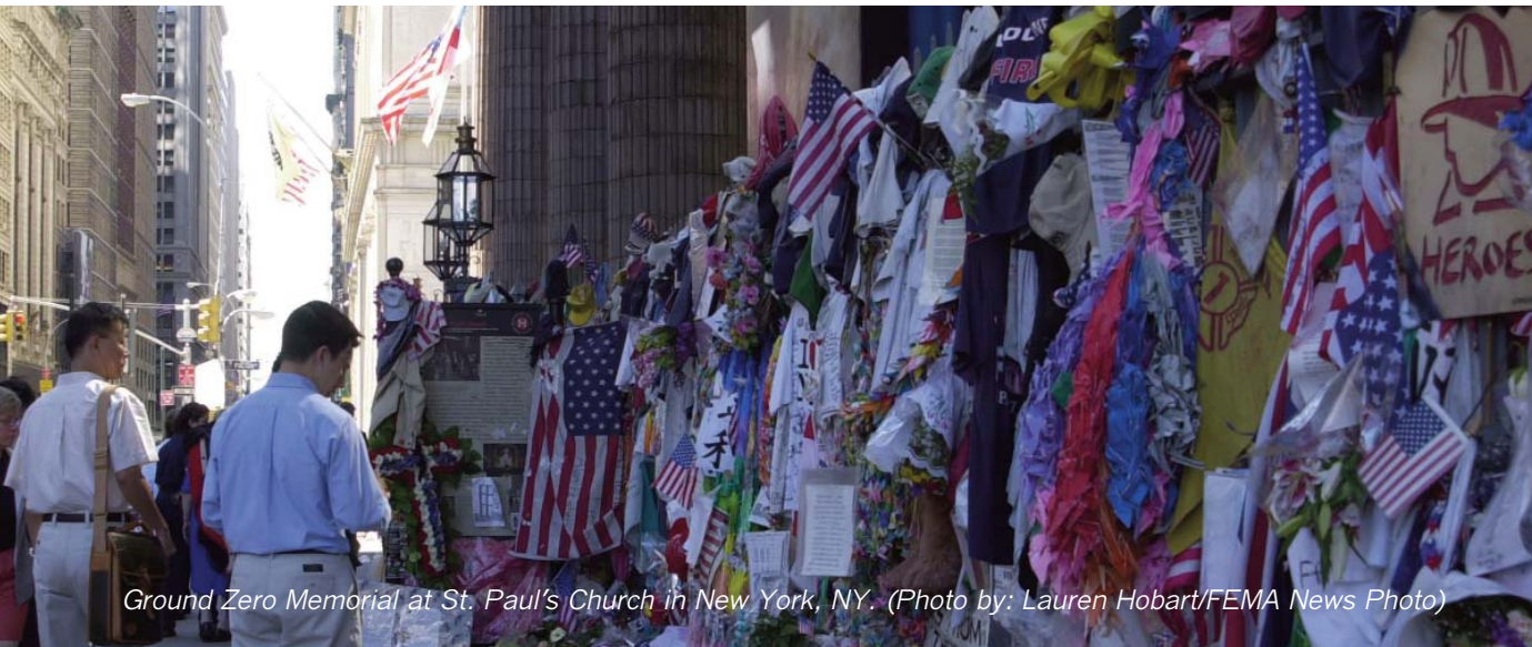
Ground Zero Memorial at St. Paul's Church in New York, NY.