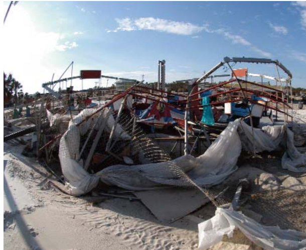
An amusement park in Gulf Shores, AL destroyed by Hurricane Ivan.

For more information, please contact: Tourism Crisis Management Institute Department of Tourism, Recreation and Sport Management University of Florida P.O. Box 118208 Gainesville, FL 32611-8208