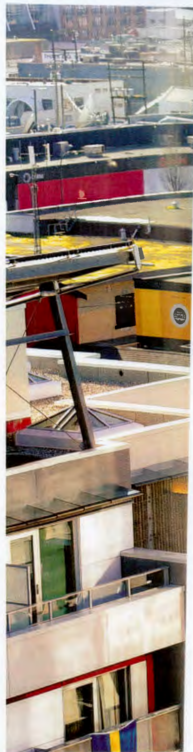
Right The Vancouver Athletes Village was converted post-Games into social housing Below right The new terminal at Beijing Airport, built for the 2008 Games

This practice can work in parallel with the management of the Olympic Games infrastructure and can be called the additive effect of legacy management, which builds on the most visible aspect of legacy, the infrastructure. If the Games took place in the recent past, the infrastructure and the post-Olympic Games legacy programmes can influence local resident's behaviours and positive legacy perceptions. If the Olympic Games took